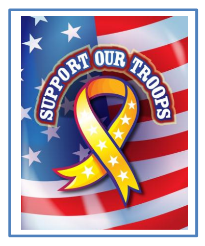
And remember . . .