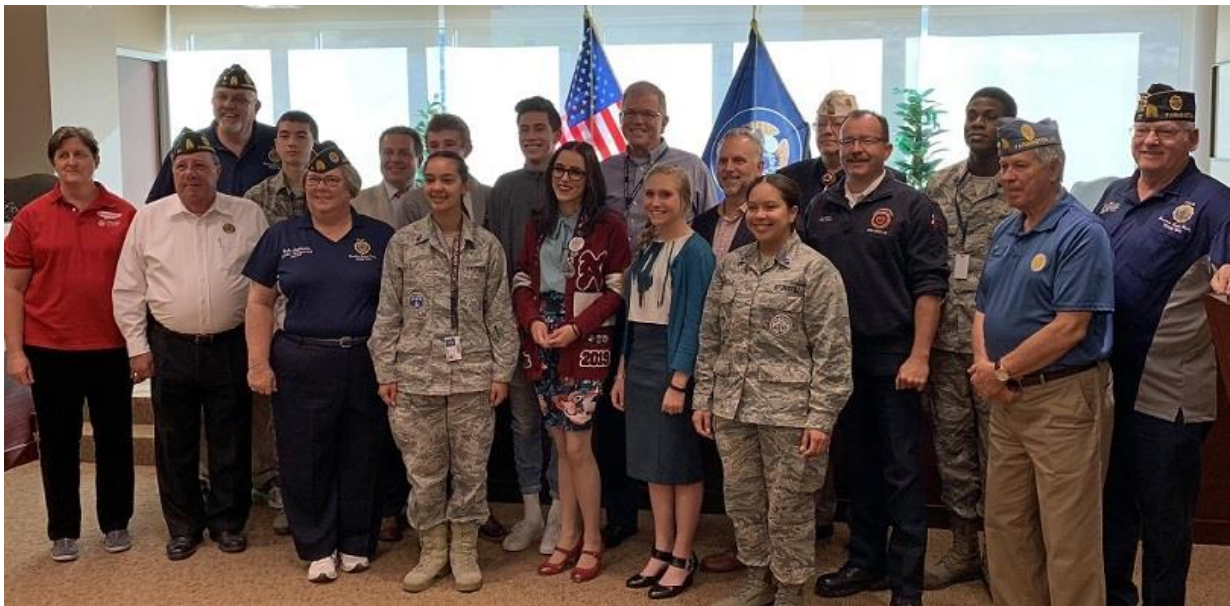
The American Legion Utah Boys State and American Legion Auxiliary Girls State staff members present Boys and Girls State graduates to the Davis County Commission on Oct. 30, 2018.