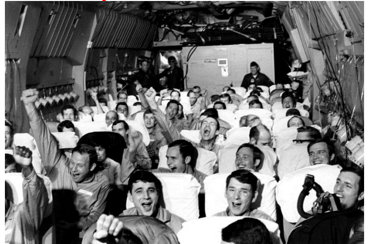
Vietnam POW on the homeward-bound C-141

Speaking to returned POWs, Pres George W Bush said: "While held POW you reflected the best of our country – acting with resourcefulness, bravery and strength. Through unspeakable conditions, you upheld your oath to defend America with honor and dignity. Your extraordinary spirit, patriotism and resolve helped defeat tyranny and build democratic and just societies, enabling decent men and women around the world to live in freedom. You continue to inspire new generations to acts of courage and compassion."