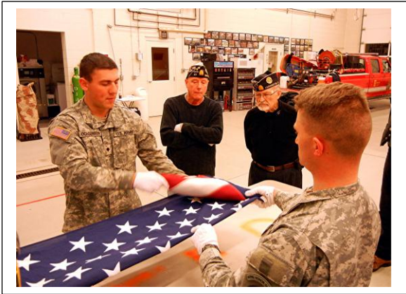
Funeral Honors training with the Utah National Guard January 31, 2012 Folding the flag and Rifle Squad Protocols