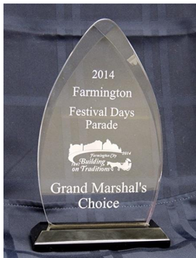
Left: The Grand Marshal's Choice trophy awarded to Post 27 for our parade entry.

Now, we turn our attention to our second annual Flag Retirement Ceremony at the Davis County Fair on the evening of August 14. Last year's unqualified success leads us to believe that this sacred rite will be an on-going annual event that will keep the honor of our national colors ever in the minds of our citizens. If you can possibly make it, drop by the outdoor arena at the Fairgrounds around 8:30 pm and enjoy this wonderful event with us.