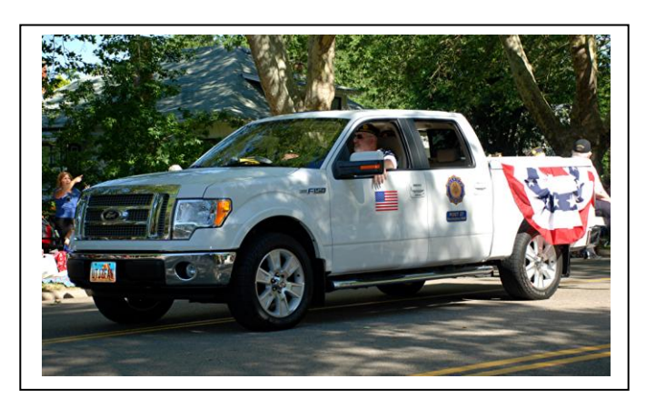
Post 27's borrowed vehicle carrying Post members