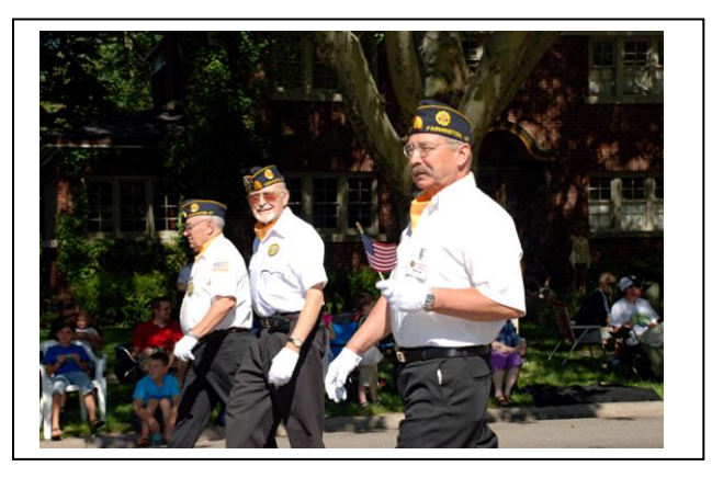
Members handing out American flags to the crowd