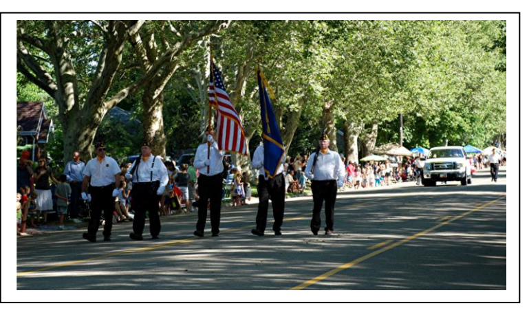
Post 27 Color Guard, vehicle, and marchers leading the parade