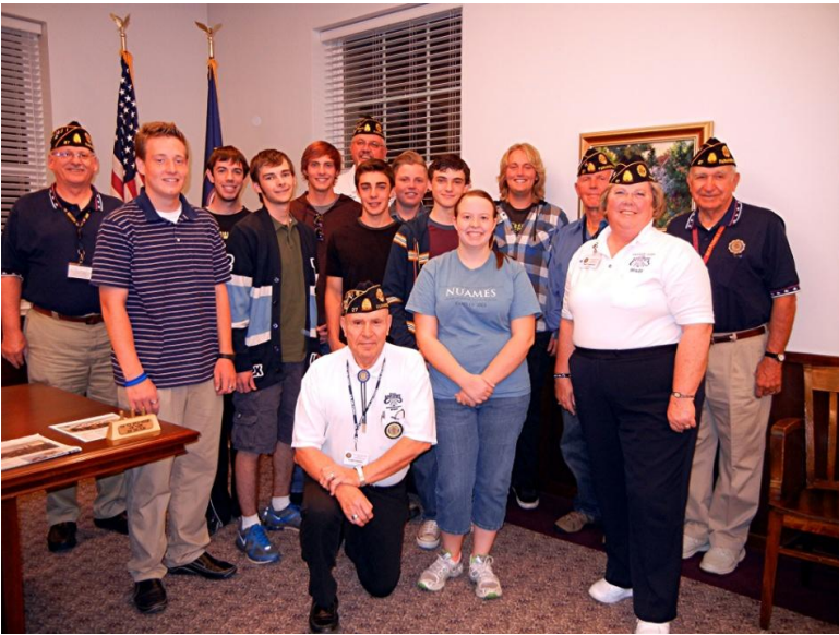
Post 27 October meeting with Post Members and Boys and Girls State 2012 graduates who told of their experiences at the June event.