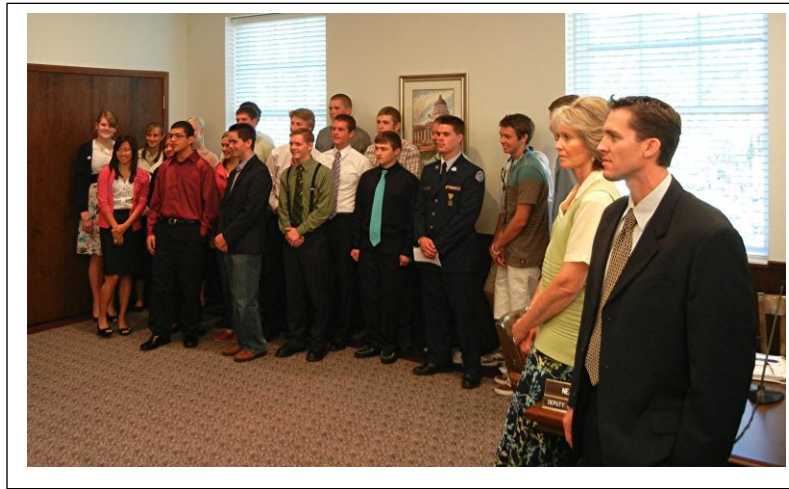
Boys and Girls State 2011 Graduates at Davis County Commission Meeting, October 18, 2011