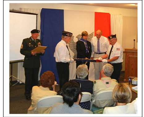
Eagle Court of Honor Flag Ceremony Sept 25, 2011 Centerville