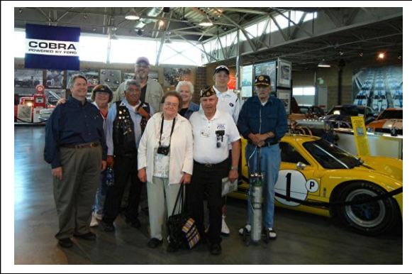
Miller Motorsports Park Sept. 17, 2011 Legion Family Members in the Museum