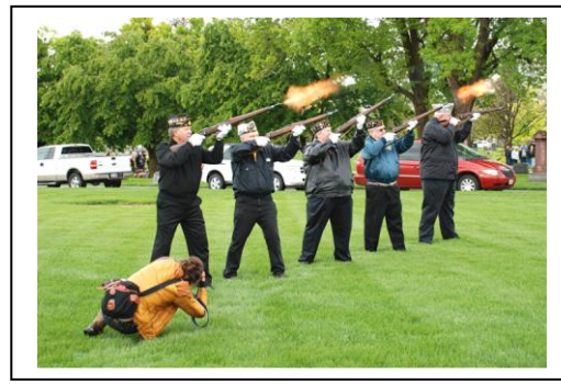
Volleys by the Rifle Squad with Standard Examiner photographer

NEXT MONTHLY MEETING: Wednesday, June 8th, 6:30 pm, Davis County Courthouse, Rm 114, Farmington