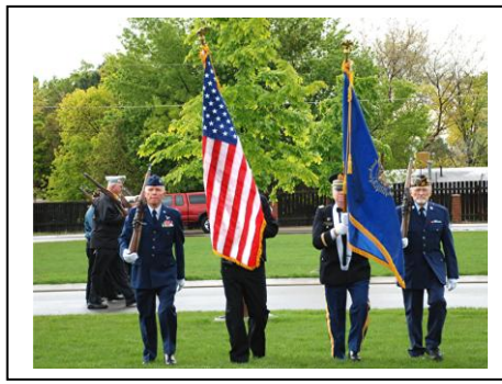
Memorial Day Color Guard & Rifle Squad