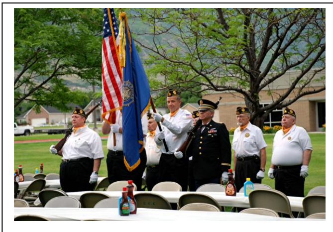
Post 27 during the Pledge of Allegiance at the Kaysville 4 th of July Celebration & Breakfast