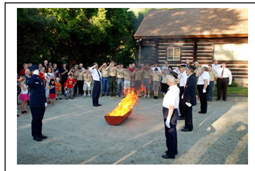
June 14 th Flag Retirement Ceremony