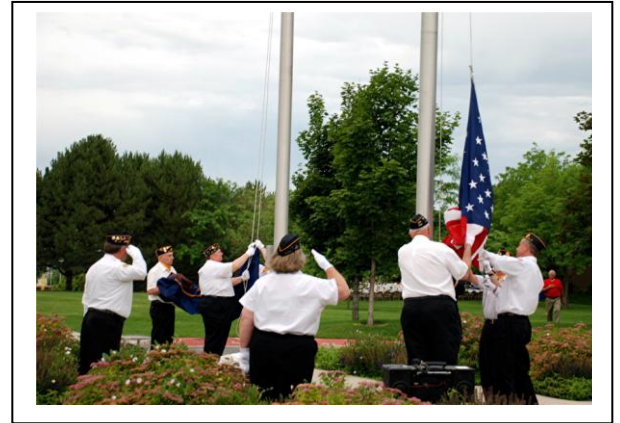
Post 27 raising the flags in Kaysville on the 4 th of July