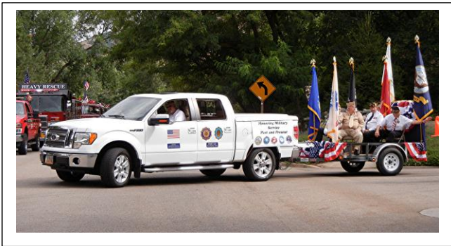
Farmington Festival Days Parade Honor Guard / Truck & float/ JGolden Barton